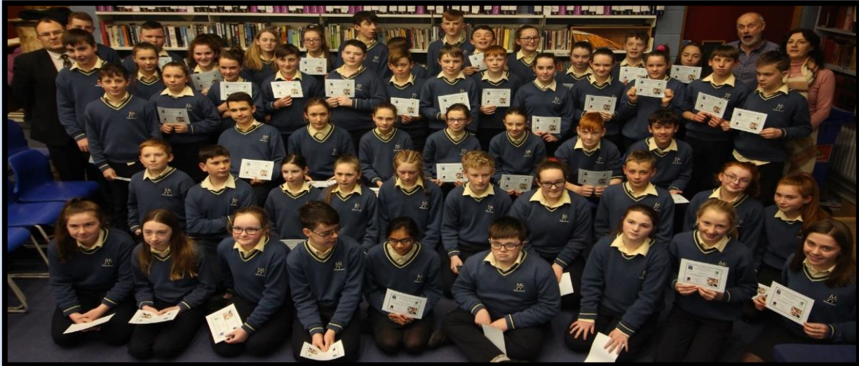
First Year Attendance Awards 2019

MICC prides itself in offering extensive opportunities that facilitate the development of our students both in and out of the classroom setting. In August 2019 we welcomed a new group of First Year students. As you can see from the following pictures, they quickly found their feet, embraced new challenges, and shone brightly in the process. Congratulations to all the First Year students who participated with enthusiasm this year.