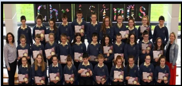
First Year Gold Word Millionaire Award