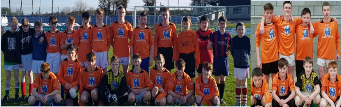
Above: MICC 1st year Soccer & Futsal Team.

It is all about participation in MICC. We would like to commend the dedicated trainers and students who represented MICC in Football, Soccer, Bowling and Athletics during the 2019/2020 season.