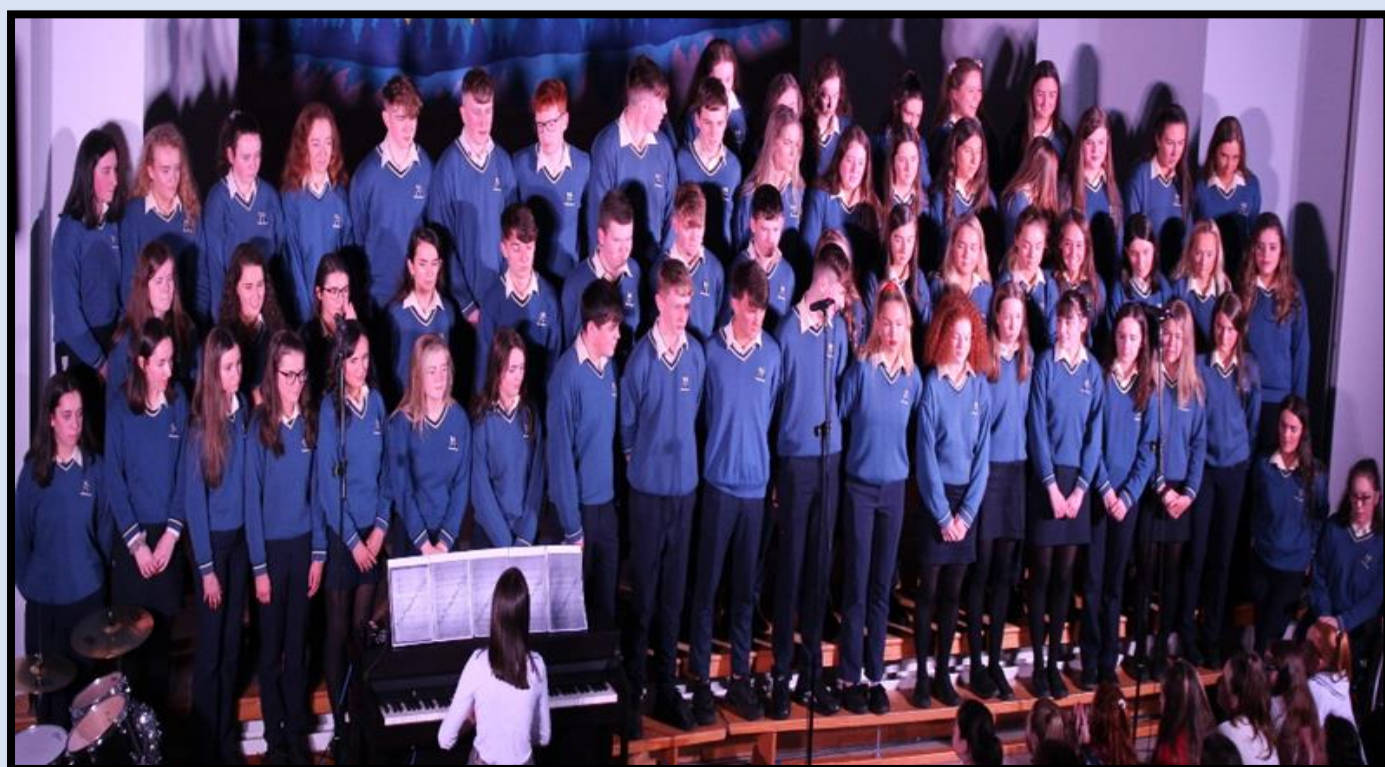
Above: Senior Choir performing at The Variety Concert.