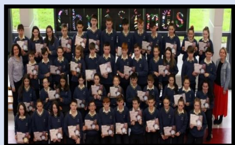
First Year Silver Word Millionaire