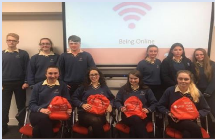
Left-TY students attending Online Safety Peer-to-Peer Training Workshop with TrendMicro. Right: TY students attending The AXA Roadsafe Roadshow.